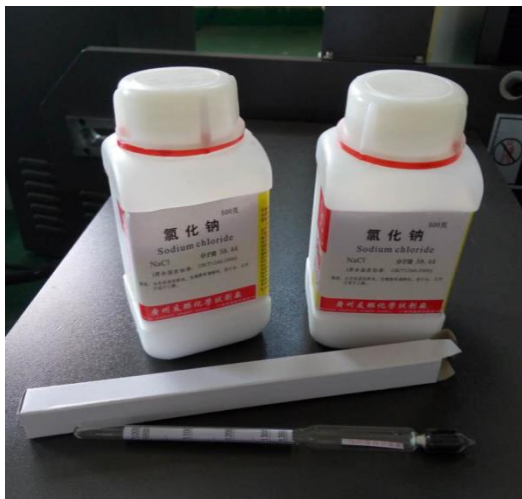
Sodium chloride (testing salt)